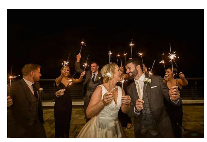
THERE WERE SPARKS: The couple ringing in New Year, at their wedding reception in The Kinsale Hotel and Spa.