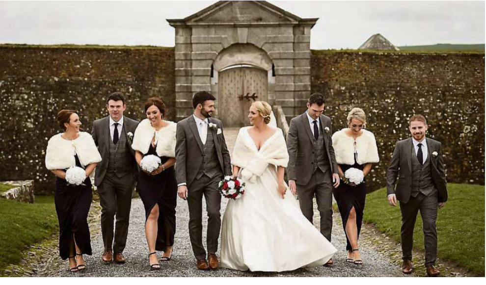
PICTURE PERFECT: The wedding photographer brought the couple with their wedding party to Charles Fort in Kinsale for photos.

If you would like your wedding to feature, email features@eecho.ie